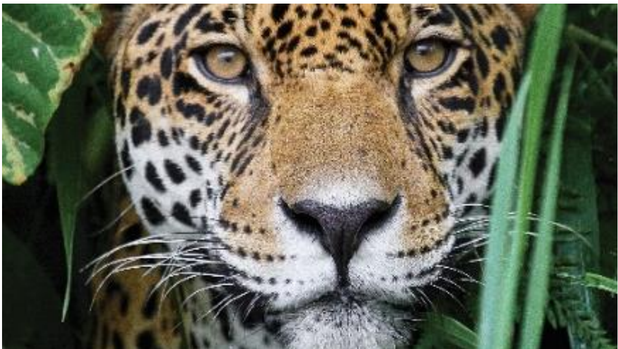
Jaguar